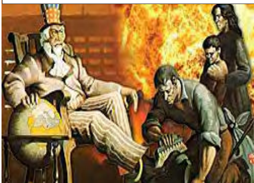
This Oct 5,1911 LIFE cartoon is a stark memo of the media change since it fell into alien hands

ONCE FREEDOM LOVER'S LOVED UNCLE SAM HAS BEEN TURNED BY A FEW SELF GOD CHOSEN RACIST PSEUDO JEW MIND MOULDING MEDIA MOGULS INTO THE WORLD'S FOLK HATED TYRANT SERVING ZION