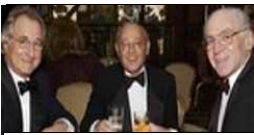
B. Madoff enjoying life with his kin leechers skoling for their kept bled till dead goys