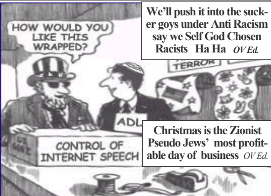
National Vanguard, Post Office Box 5145 Charlottesville VA 22.9.05 ( Another Xmas present for the goy suckers. OV )

Our leechers aim is to their total dictation over the internet gain to so own all the means to force feed their Chosen Race propaganda into our brains OV Ed.