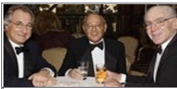
B. Madoff enjoying life with his kin leechers skoling for their kept bled till dead suckers