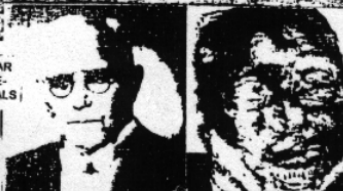
A LATVIAN COLLEGE PROFESSOR WHO LECTURED AGAINST SOVIET OCCUPATION PHOTOED BEFORE AND AFTER BEING TORTURED TO DEATH BY BERIA'S KIN GANG OF SELF SANCTIFIED CHOSEN RACISTS

PLEASE EXCUSE THESE UNCLEAR COPIES OF THE KATYN, POLAND MASS GRAVES ETC. PHOTOS DUE TO MY TECHNICAL INABILITY TO DO BETTER