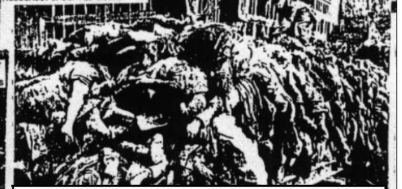
A FUNERAL PYRE OF THE DRESDEN MASS MURDERED